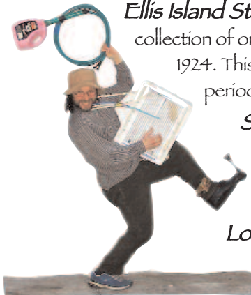
Science of Sound - homemade instruments and lots of fun!