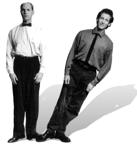
Imagination In Motion

take advantage of our reduced summer prices*