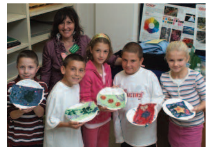
Papermaking - children display their works of art and their smiles!

Murals or Mosaics - Campers can create a lasting piece of art to beautify your camp or town. Murals or Mosaics can decorate walls, planters, doorways, etc. - indoors or out. Children are actively involved with the work individually and in a group effort. Pricing is based on the scope of the project. Call for prices