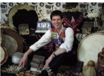
Ha La La iAfrika - music, song & dance. Interactive and fun