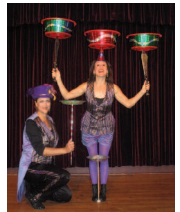
Circus Sisters - physical comedy, circus skills, music & great entertainment!

So, This Is Opera! or The Gingerbread Man and The Three Bears - Campers will discover the joy of Opera with these interactive and entertaining performances. The audience will act, sing, play instruments and participate. Even PreK campers will learn to "hold a note" with The Gingerbread Man and The Three Bears. $800